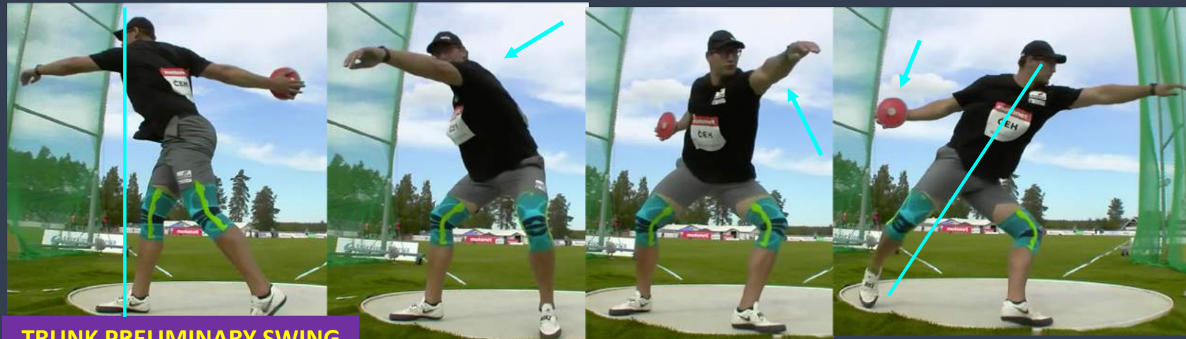
TRUNK PRELIMINARY SWING