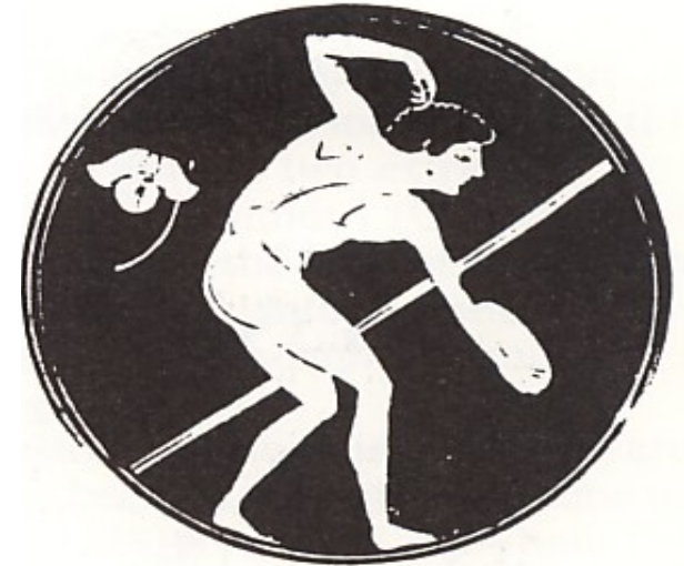
500 B.C. Discus Throw

In the Ancient times , it was praising the concept of the perfect human in relation to the image of Gods. The competition was to become an Olympic champion and Olympic champions were treated like Gods , having their statues and the recognition of their fellow citizens.